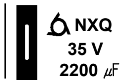
FRONT VIEW OF CAPACITOR