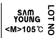
BACK VIEW OF CAPACITOR